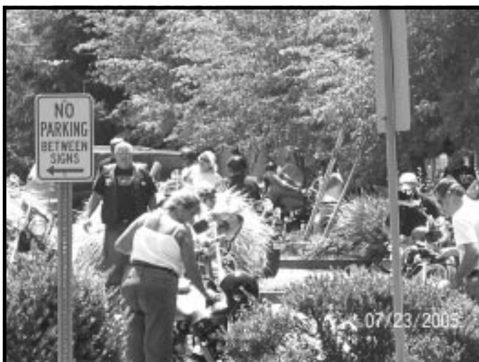
Literacy and motorcycle fans from near and far at the Ginny Marie Young Rally for Literacy.